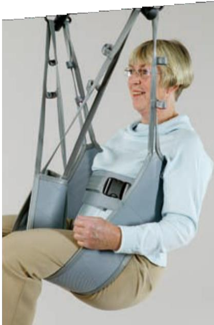
Domino Hygiene is incl. safety belt. Suitable for lifting persons to and from sitting positions. Suitable for hygiene and bathroom purposes.

Domino Slings are produced using a specially manufactured polyester material, which unites comfort with an incredible strength. The material has an emery finish on the inside. This gives the Sling a cotton-like surface, which is both comfortable for the user and at the same time ensures that the Sling does not slide. The material is fire retardant.