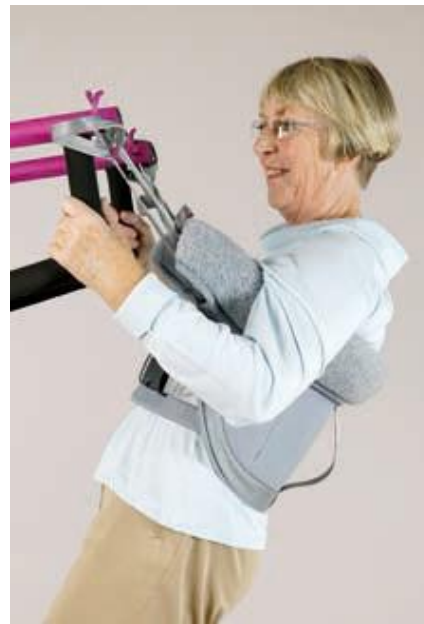
Domino Thorax . Only for stand-up hoist. Unique design and padding. Provides optimum support for stand-up lifting. Can also be supplied without padding under the arms.