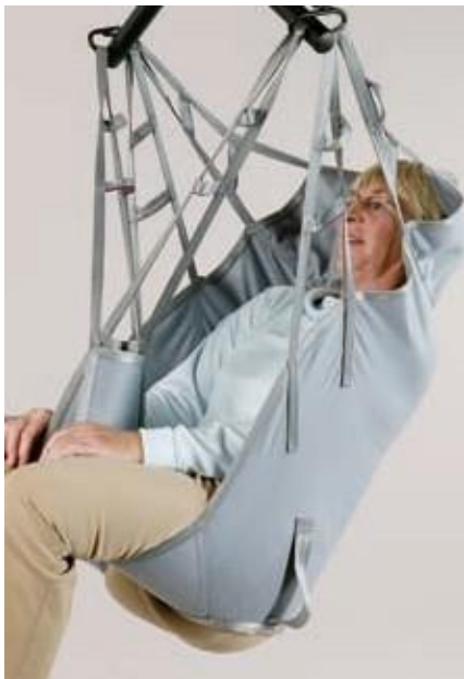
Domino Classic . Suitable for persons with little control over their head and body. Suitable for lifting from a lying position. Supports the whole body. Extra foam padding in leg, body and head section – for better comfort.