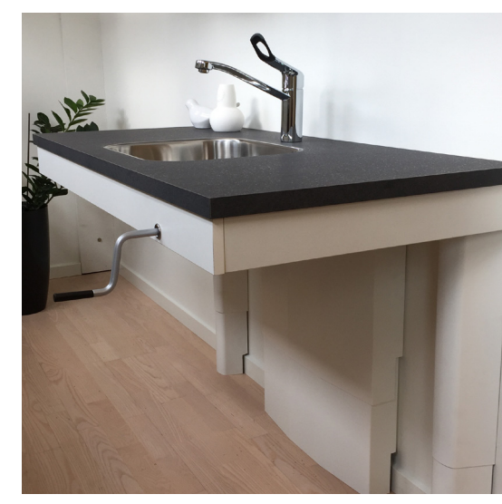
The handle can be removed if it is in the way.

The Flexi systems are ideal for private homes, schools, training kitchens, nursing homes, homes for elderly people and for people with disabilities.